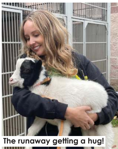
The runaway getting a hug!

When people think of an animal shelter, they usually think of dogs and cats - but we are far from it! In 2021 alone, our Animal Control Division fielded over 4,302 calls from the public and took in over 2,100 animals in need of intervention. We've seen everything from infant chipmunks to deer, to turtles and even a baby alligator! Our ACO team is trained to safely handle anything that comes our way. One of our cutest encounters was this baby goat who made his way onto someone's porch and was crying to go inside! Our team responded quickly and we were able to find the farm he belonged to.