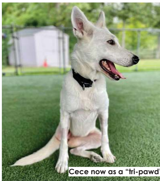
Cece now as a “tri-pawd”

Free of pain and now a “tri-pawd”, Cecelia finally began her journey into a forever home! She spent some time in our vet tech room, where we learned she liked to spend time with both cats and dogs. Being that Cece was already popular on social media, it didn't take long to find her the perfect family!