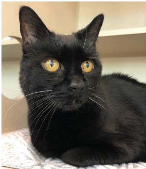
Our sweet boy Ronan, handsomely posing for his adoption photo!