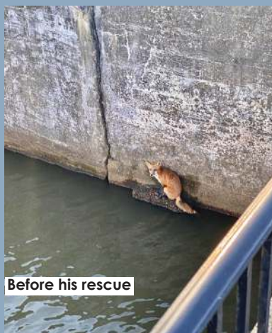
Before his rescue

We all know that foxes can be curious, and sometimes mischievous! A young fox recently found himself in quite the predicament in Asbury Park. The adolescent was most likely walking around the ledge of a lake when he slipped in. Thankfully, he found a small ledge where he was spotted by a Good Samaritan who called our Animal Control team. With the help of both the Police and Fire Department, we were able to get ladders down into the water to finally rescue the fox. After a few days in our care to warm up and regain his strength, the fox was released back onto the beach where other foxes live. Another lifesaving rescue for Monmouth County wildlife!