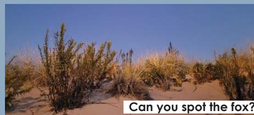
Can you spot the fox?

We all know that foxes can be curious, and sometimes mischievous! A young fox recently found himself in quite the predicament in Asbury Park. The adolescent was most likely walking around the ledge of a lake when he slipped in. Thankfully, he found a small ledge where he was spotted by a Good Samaritan who called our Animal Control team. With the help of both the Police and Fire Department, we were able to get ladders down into the water to finally rescue the fox. After a few days in our care to warm up and regain his strength, the fox was released back onto the beach where other foxes live. Another lifesaving rescue for Monmouth County wildlife!