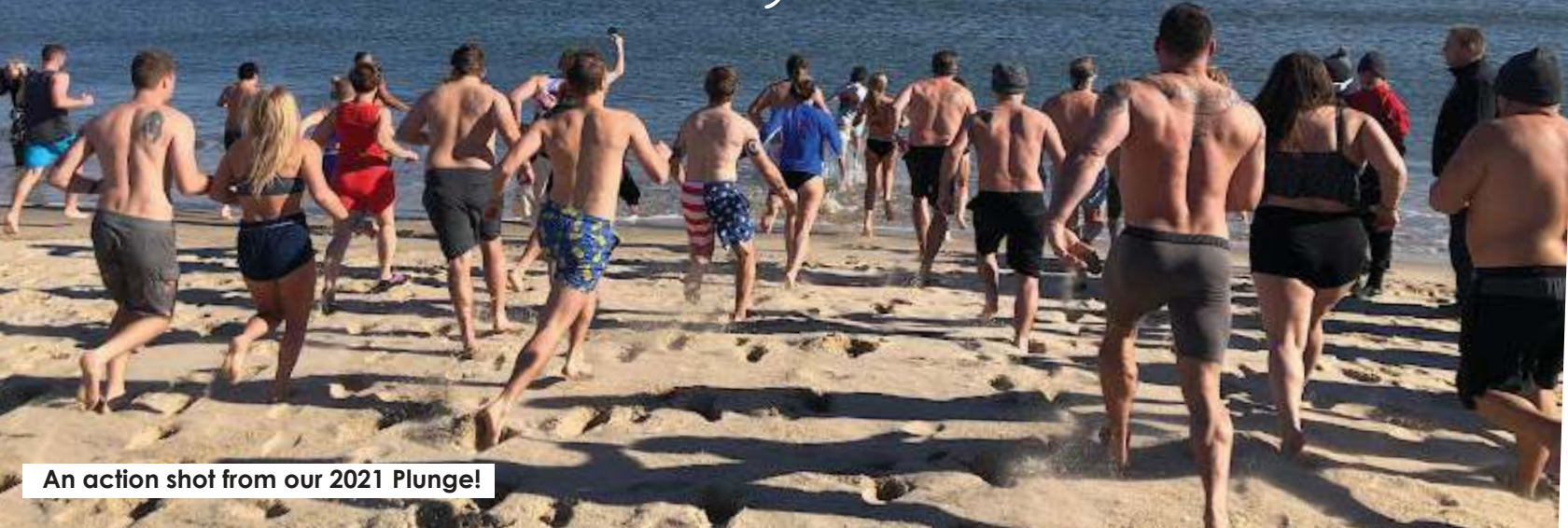
An action shot from our 2021 Plunge!