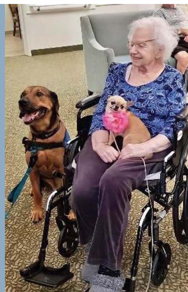
Visit to a senior community

Our Pet Therapy and Humane Education teams are composed of a small group of volunteers, and their certified pet therapy animals, who travel to various venues to promote kindness and compassion. In 2021, our Pet Therapy and Humane Education teams visited with over 1,000 children and adults in Monmouth County! Each therapy animal undergoes training and testing with our instructors to ensure they're a perfect match for the program - we've had dogs, cats, rabbits and even a rat become certified therapy animals! The largest population of people who benefit from our Humane Education, Pet Therapy and Read to Dog programs, are children, mainly scout troops and classroom groups. With the development of our "Cool to be Kind" curriculum, children follow along with a hands-on presentation of everything they need to know to treat our companion animals with love and kindness. Our tiny but mighty group of volunteers continue to make a difference in our community, one animal at a time!