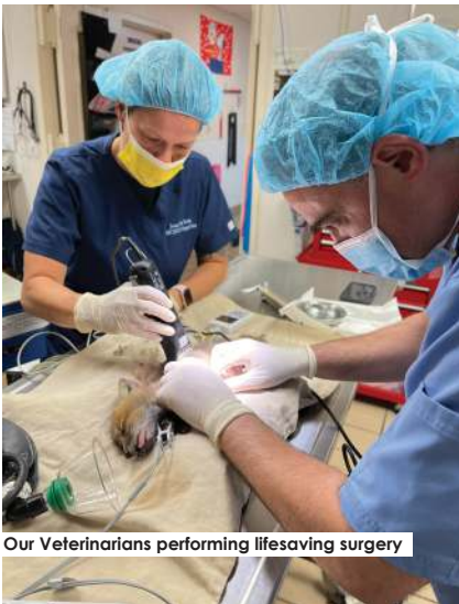
Our Veterinarians performing lifesaving surgery