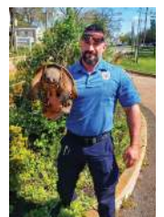
You can see the variety of turtles we get calls for!