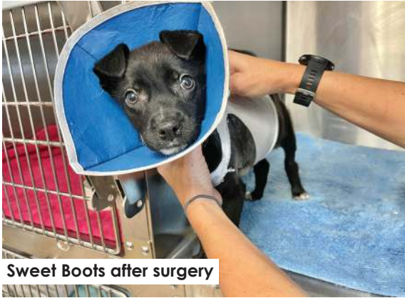
Sweet Boots after surgery

Poor Boots was born outdoors, was the runt of his litter and had the odds stacked against him until he was thankfully rescued and brought to the Monmouth County SPCA. Boots suffered from a congenital defect where blood vessels wrapped around his esophagus causing dilation, difficulty swallowing and can lead to aspiration pneumonia. Without a special surgery called a thoracotomy, Boots would suffer from lifelong problems growing, bouts of pneumonia and sickness and likely a shortened lifespan. Our team knew Boots needed this surgery to live a normal life, and we turned to you, our donors, for support.