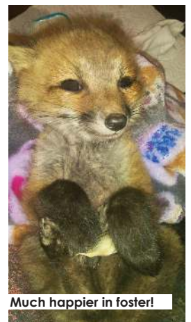
Much happier in foster!

Just dogs and cats here at the MCSPCA? No way! The Monmouth County SPCA continues to be a leader in the state for Animal Control and the more towns we take on, the more animals we take in! During the warmer months, wildlife calls to our Animal Control dispatch triple and our team is out 24/7 rescuing, relocating, rehabilitating and rehoming almost every NJ species you can think of. This summer, our ACO Division got a call about a baby fox that was stuck under a shed and crying out in distress. Our team arrived and was able to free the pup but then noticed he had an open, infected wound on his side. The 8-week-old fox was taken to our Vogel Veterinary Care Center, where our skilled veterinarians cleaned out his wounds, administered antibiotics and sutured him up so that he could finally feel better. A few weeks later, the little fox is doing great with his rehabilitator - he's growing strong and will be released into the wild when he's ready. We're grateful this little guy got a second chance, and that we were able to provide the care he needed to get it!