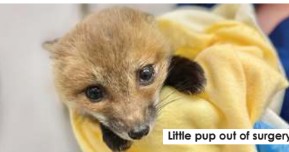
Little pup out of surgery

Just dogs and cats here at the MCSPCA? No way! The Monmouth County SPCA continues to be a leader in the state for Animal Control and the more towns we take on, the more animals we take in! During the warmer months, wildlife calls to our Animal Control dispatch triple and our team is out 24/7 rescuing, relocating, rehabilitating and rehoming almost every NJ species you can think of. This summer, our ACO Division got a call about a baby fox that was stuck under a shed and crying out in distress. Our team arrived and was able to free the pup but then noticed he had an open, infected wound on his side. The 8-week-old fox was taken to our Vogel Veterinary Care Center, where our skilled veterinarians cleaned out his wounds, administered antibiotics and sutured him up so that he could finally feel better. A few weeks later, the little fox is doing great with his rehabilitator - he's growing strong and will be released into the wild when he's ready. We're grateful this little guy got a second chance, and that we were able to provide the care he needed to get it!