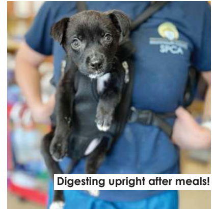
Digesting upright after meals!

Boots received his surgery and recovered beautifully in his foster home over a period of 6-weeks. Once he was available for adoption, he came back to the shelter and was adopted within days!