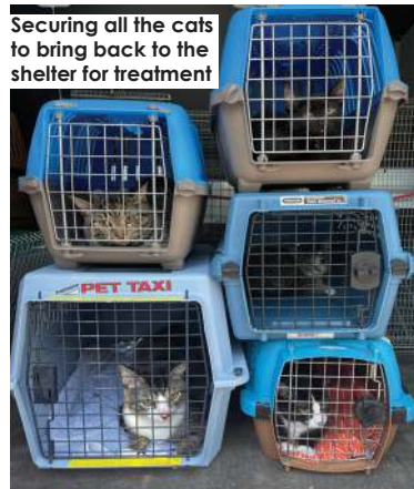
Securing all the cats to bring back to the shelter for treatment

Early this summer we got a call from the manager of a motel a few miles away from the shelter. There were guest complaints of a foul smell from a room so our Humane Law Enforcement Division responded ASAP. What we found upon arrival were 13 cats and kittens living in clutter and filth, scrounging for food and water and in desperate need of veterinary care. After recovering the cats and kittens, hiding in every closet, cabinet and corner, they were transported to the shelter for assessment. The cats were generally in fair condition, but none of them were fixed, and some suffered from chronic illnesses that had never been addressed. Thankfully, these kitties ended up in the best of hands and were given everything they needed to find their forever homes! All but 1 has been adopted and we're hoping that by the time you read this - they all will have found a forever family! Your support is why we're able to save these lives!