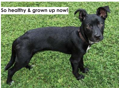
So healthy & grown up now!

Boots is doing amazing in his new home; he's playful, sweet and affectionate - everything you'd expect from a happy puppy! Boots will need to be fed small meals in an elevated feeder for the remainder of his life but other than that, he'll require no special medical treatment. Success stories like this remind us how grateful we are to have such a supportive donor base to give us the power to say "Yes, we can take them in!"