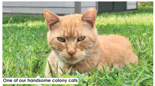
One of our handsome colony cats

The Monmouth County SPCA has contracted almost double our amount of Animal Control contracts since 2018 and with that, comes more towns coming on board with TNR programs. In 2016 not 1 municipality had a TNR program, yet today we have 16 municipalities who have passed TNR resolutions for the MCSPCA to perform TNR services in their communities. In 2020, 2,700 community cats went through the TNR program, which provides spay/neuter, vaccinations and microchips. The TNR program not only stops the unnecessary over-breeding of community cats, but addresses a major public health issue of preventing the spread of the deadly rabies virus. Our organization has some exciting plans in the coming months, and by our next newsletter, we hope to share these lifesaving initiatives with you!