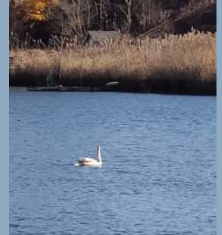
The swan, covered in oil to being released!