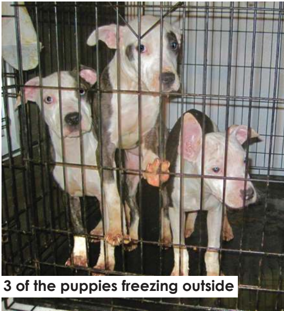
3 of the puppies freezing outside

On a cold night in March, our Humane Law Enforcement Division responded to a call from the Neptune City Police Department about excessive barking. When we arrived at the apartment complex, our team heard the barking and whining from outside and we were prepared for the worst. What we found were 8 dogs and puppies, stuffed together in small crates, and living outside on a freezing cold porch with only a plastic tarp to protect them from the elements. We recovered every dog from the scene, who drank and ate ravenously when we offered them food and water. When the dogs and puppies arrived at our shelter, we made sure they had comfy blankets, plenty of accessible food and water and finally a warm place to sleep. The dogs were treated for their skin sores, intestinal parasites, ear infections and lack of care and placed in foster care for the length of the investigation.