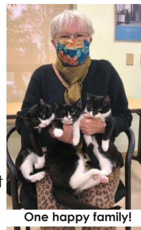
One happy family!

Danny, Jack and Lloyd came to us as tiny stray kittens who unfortunately tested positive for FeLV or Feline Leukemia Virus. FeLV (different from FIV) is easily transmitted to other cats and often brings a short life expectancy but regardless, we were determined to find them all homes. We were over the moon when a wonderful woman decided to take ALL 3 boys home! We couldn't have asked for a happier ending!