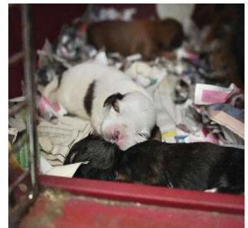
Day-old puppies in a dirty crate

The Road to Recovery Begins & Ends with LOVE (and we had plenty to give!)