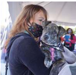
A few of the adorable pups who found their forever homes that day!