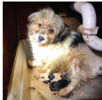
A litter of pups born under a sink

Several pregnant dogs, some dogs who had just given birth and newborn puppies just days old were rescued from the house. Many of the dogs were so matted in their own urine and feces that they could barely walk in their small, excrement filled kennels. The dogs and puppies were forced to drink out of filthy water bowls, if there were any accessible at all. It was a horrific event for us, but we knew that day was the start of their new life.