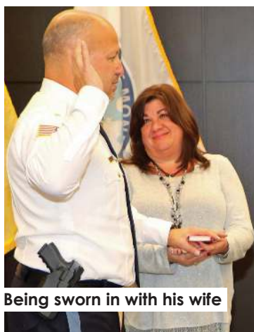
Being sworn in with his wife